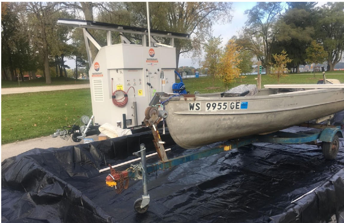
Figure 2. A large tarp was placed on a wood frame to collect small-bodied organisms that were washed off the watercraft in between cleaning treatments.

After treatments were completed, the experimenter recovered any items still attached. For the macrophyte evaluation, a new replicate was not started until 100% of the plant material from the previous replicate was accounted for. Mass measurements and the placement sheets were compared to ensure all material was removed. Water loss and evaporation of the macrophytes