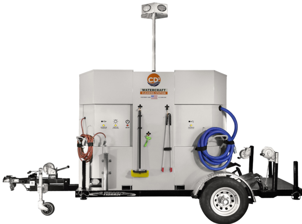
Figure 1. An example of the CD3 Wayside Cleaning System used in this study.

One common barrier to action that boaters report is not having the tools needed to adequately clean their boats (Jensen 2010, Great Lakes Sea Grant Network 2014). The CD3 System is a recent advancement in technology designed to remove plants, animals and water from watercraft. However, it is unknown how effective these tools are at removing AIS from watercraft when compared to hand removal. Previous work has compared hand removal and high-pressure washing as removal strategies for aquatic macrophytes and small-bodied organisms, with hand removal and pressure washing being comparable for macrophytes and pressure washing being more effective at removing small-bodied organisms (Minnesota DNR 1994, Rothlisberger et al. 2010). Determining how CD3 System efficacy compares to these prevention tools can help AIS managers make decisions on whether and how to use this prevention tool.