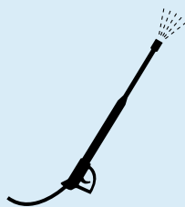
One or two pressure washers

The goal is to quickly and effectively inspect and clean as many boats as possible. Equipment needed: