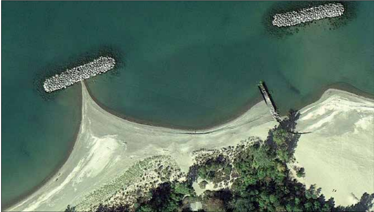
Figure 2: Offshore breakwaters and groin at Presque Isle, Lake Erie

characteristics that limit its use as a shore protection strategy. First, the sand of the beach is highly mobile, so that the beach width and profile are not consistent and frequently not predictable. Second, the footprint of a beach is flat and wide across the shore. It also extends underwater a long distance, so its true width may be two or three times as large as the visible dry beach. To get an area wide enough to dampen waves effectively, especially if there are water-level variations, either significant upland area must be dedicated as a beach, or the same amount of land or more sand must be retrieved from the bottom.