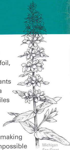
Michigan Sea Grant

spread from lake to lake on trailers and boats entangled by weeds.