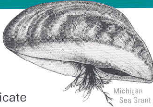
Michigan Sea Grant

Perhaps the most important thing to know about zebra mussels is that they can spread most easily when they're in their larval stage. That's when they're practically invisible to the naked eye and can go unnoticed on your boat or bait bucket.