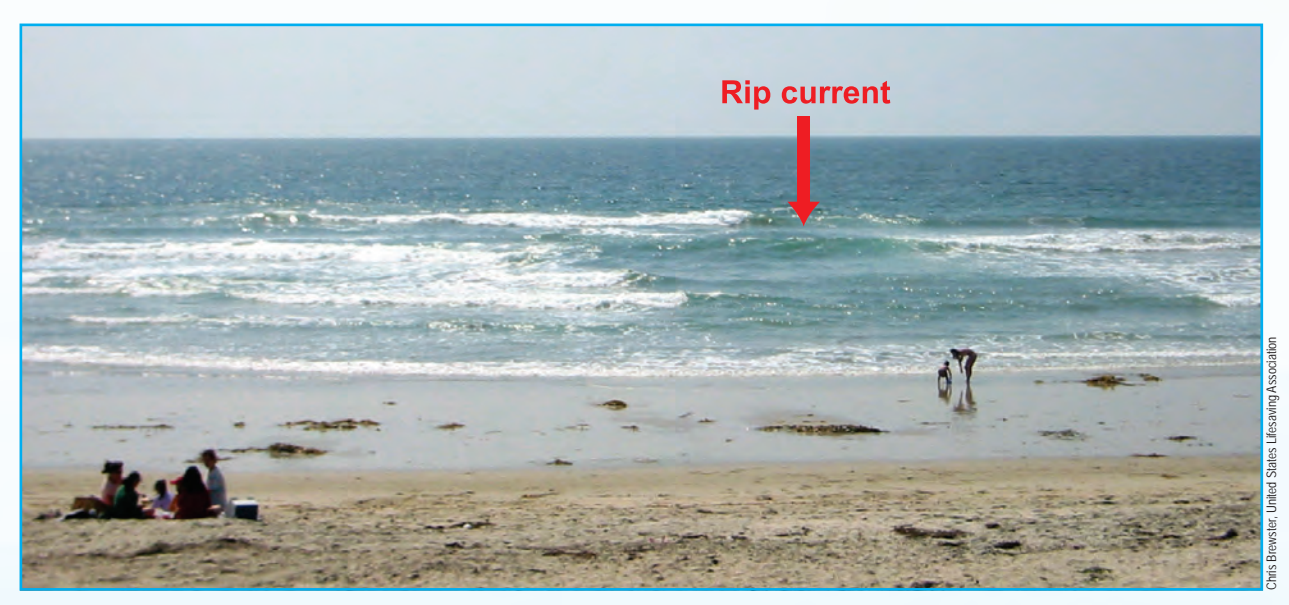
A break in the incoming wave pattern is one sign of a rip current.