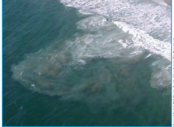
Rip currents often generate a plume of sediment moving away from shore.