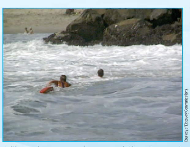
A lifeguard rescues a swimmer caught in a rip current.