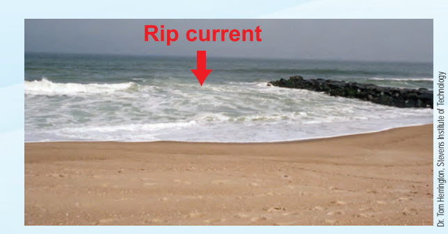
Rip currents often form near coastal structures.