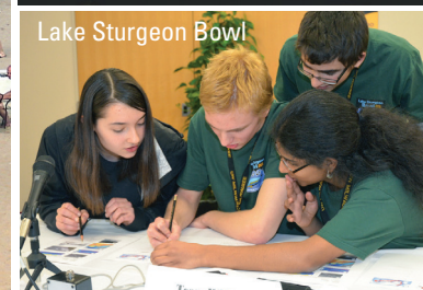
Lake Sturgeon Bowl